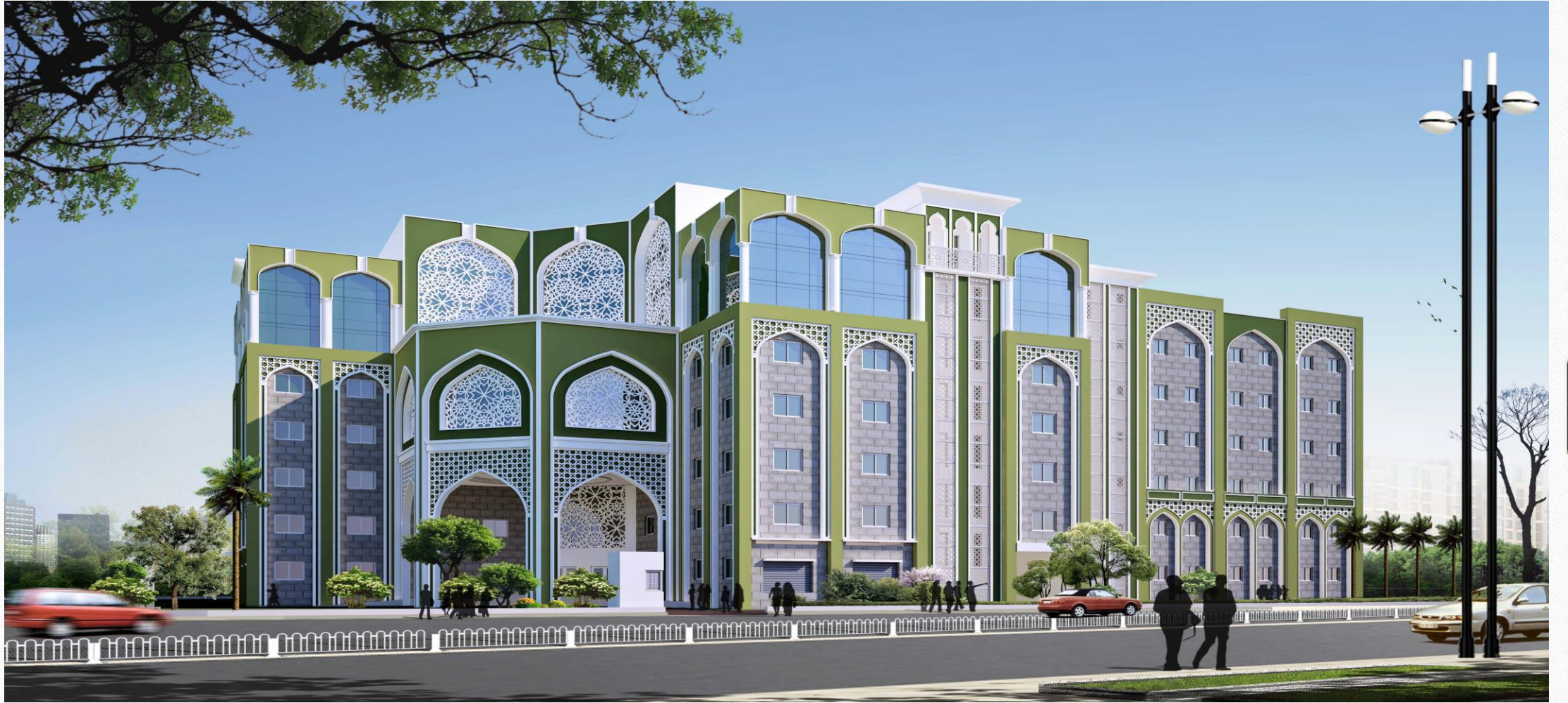
Proposed campus at New Town, Kolkata of Al-Ameen Mission Institute for Education Research & Training