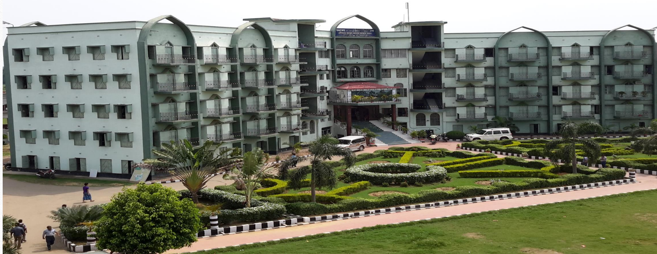
1 st stepping stone of Al-Ameen Mission at Khalatpur